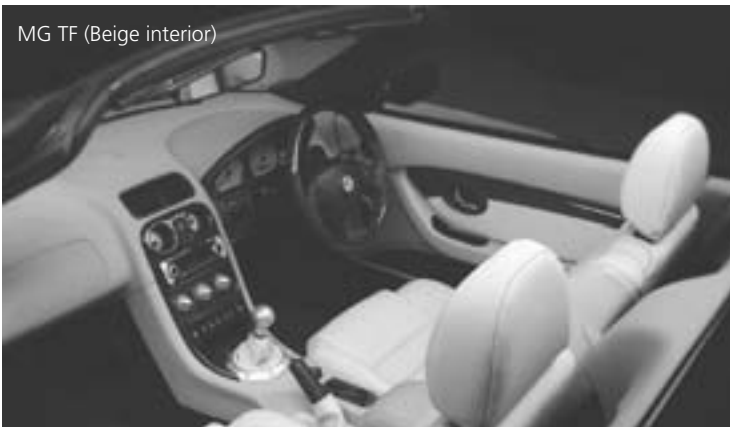
MG TF (Beige interior)

Engine : All alloy 4 in line Capacity: 1796 cc twin overhead cam Maximum power: 100kW @ 6750rpm Performance: 0-100 kmh 8.8 secs. Top speed 205kmh Safety: Driver & passenger airbags Security: Remote central locking and security immobilizer Features: 16" square spoke alloy wheels with space saver spare, hood cover, front fog lights, air conditioning, power windows & CD radio.