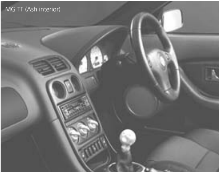
MG TF (Ash interior)

Engine : All alloy 4 in line Capacity: 1796 cc twin overhead cam Maximum power: 88kW @ 5500rpm Performance: 0-100 kmh 10.2 secs. Top speed 190kmh Safety: Driver & passenger airbags Security: Remote central locking and security immobilizer Features: 16" square spoke alloy wheels with space saver spare, hood cover, front fog lights, air conditioning, power windows & CD radio.