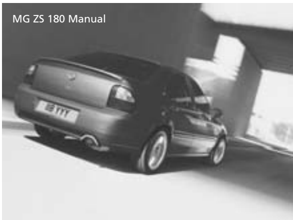
MG ZS 180 Manual

Engine: Aluminum Alloy construction. Transverse 4 Cylinder 16 valve. Capacity: 1796 cc Maximum power: 118 kW @ 6900 rpm Performance: 0-100 kmh 7.5 secs. Top speed 209 kmh Safety: Driver & passenger airbags Security: Remote central locking and security immobilizer Features: Sports body kit, rear spoiler, sports seats, 17" 15 spoke alloy wheels, 6 speaker CD stereo, ABS brakes with EBD, front fog lights.