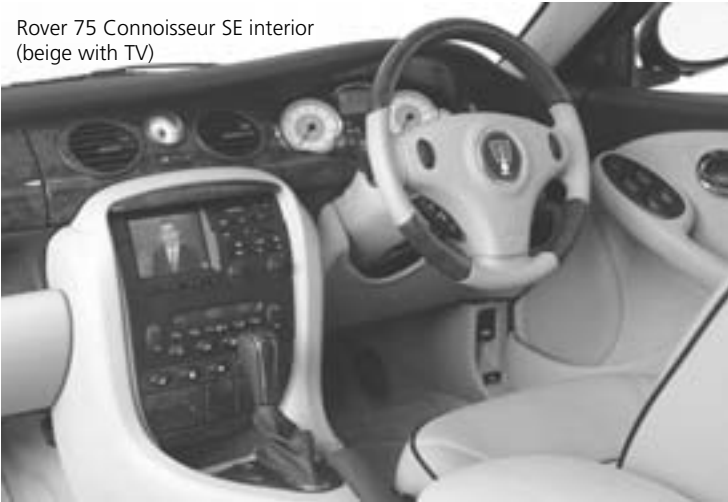
Rover 75 Connoisseur SE interior (beige with TV)

Engine: Aluminum alloy construction. Transverse V6 layout. Variable intake system. Capacity: 2.5 litre Quad Cam V6. Maximum power: 130kW @ 6500rpm Performance: 0-100 kmh 9.5 secs. Top speed 215kmh Safety: Front side & roof airbags (6 in total) Security: Remote central locking and security immobilizer Features: 16" forged spoke alloy wheels, electric sunroof, climate control air conditioning, leather trim, trip computer, electric memory seats, power windows and CD radio.