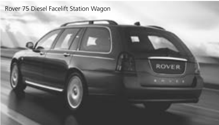
Rover 75 Diesel Facelift Station Wagon

Wagon features: (as above) plus, 1200 litres flexible loadspace, 60:40 split rear seat, 2060mm flat cargo capacity, under rear floor stowage, roller security mesh, twin roof rails.