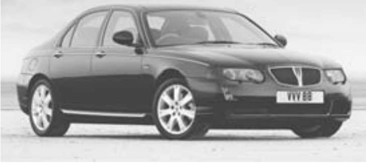
Rover 75 Facelift (Classic wheels fitted)