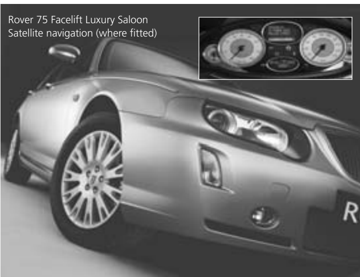
Rover 75 Facelift Luxury Saloon Satellite navigation (where fitted)

Engine: Aluminum alloy construction. Transverse V6 layout. Variable intake system. Capacity: 2.5 litre Quad Cam V6. Maximum power: 130kW @ 6500rpm Performance: 0-100 kmh 9.5 secs. Top speed 215kmh Safety: Front side & roof airbags (6 in total) Security: Remote central locking and security immobilizer Features: 17" star-spoke alloy wheels, in-dash TV monitor, satellite navigation, heated front seats, rear parking sensors, wood trimmed steering wheel, dual zone air conditioning, cruise control, ABS brakes, steering wheel mounted audio controls, power windows and mirror, CD radio.