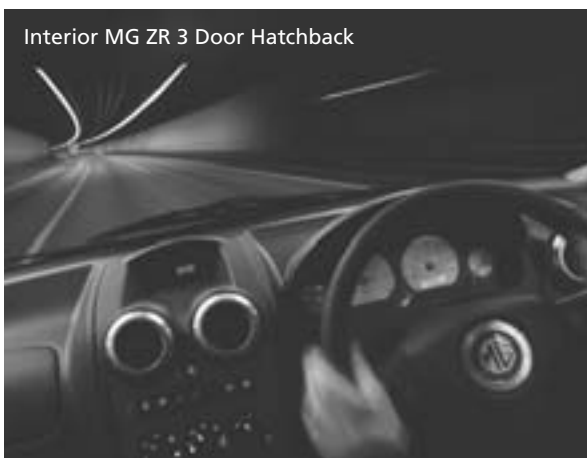
Interior MG ZR 3 Door Hatchback

Engine: Aluminum Alloy construction. Transverse V6 layout. Variable intake system Capacity: 2.5 litre V6 Maximum power: 140 (133) kW @ 6500 rpm Performance: 0-100 kmh 7.2 (9.0) secs. Top speed 227 kmh Safety: Driver & passenger airbags (6 in total) Security: Remote central locking and security immobilizer Features: 18" alloy wheels, sports leather seats, electric seat controls, cruise control, MP3 compatible CD player, front fog lights, power windows & mirrors, ABS brakes, trip computer, dual zone climate control AC