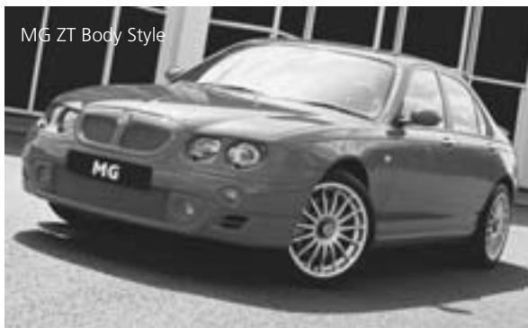
MG ZT Body Style

Engine: Aluminum Alloy construction. Transverse V6 layout. Variable intake system Capacity: 2.5 litre V6 Maximum power: 165kW @ 6400 rpm Performance: 0-100 kmh 7.2 secs. Top speed 227 kmh Safety: Driver & passenger airbags (6 in total) Security: Remote central locking and security immobilizer, Features: 18" alloy wheels, sports leather seats, electric seat controls, cruise control, rear lip spoiler, MP3 compatible CD player, front fog lights, electric sunroof, power windows & mirrors, ABS brakes, Dual zone climate control AC