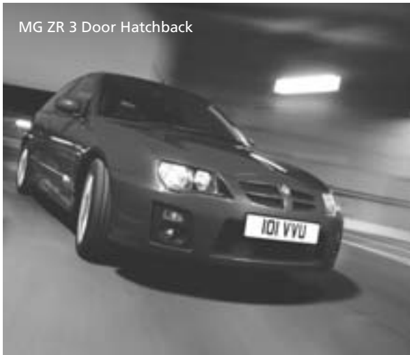
MG ZR 3 Door Hatchback