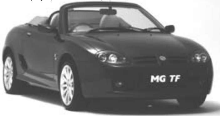
MG TF Body style (160 wheels fitted)