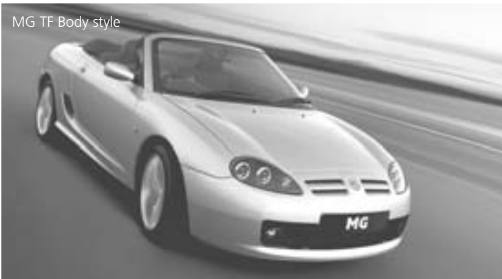
MG TF Body style

Engine : All alloy 4 in line Capacity: 1796 cc twin overhead cam Maximum power: 118kW @ 6900rpm Performance: 0-100 kmh 7.8 secs. Top speed 220kmh Safety: Driver & passenger airbags Security: Remote central locking and security immobilizer Features: External bright trim, uprated brake package, 16" eleven-spoke sports wheels, hood cover, sport suspension, front fog lights, air conditioning, power windows & CD radio.